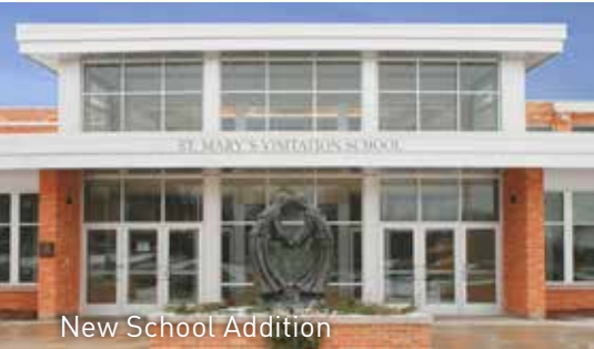
New School Addition