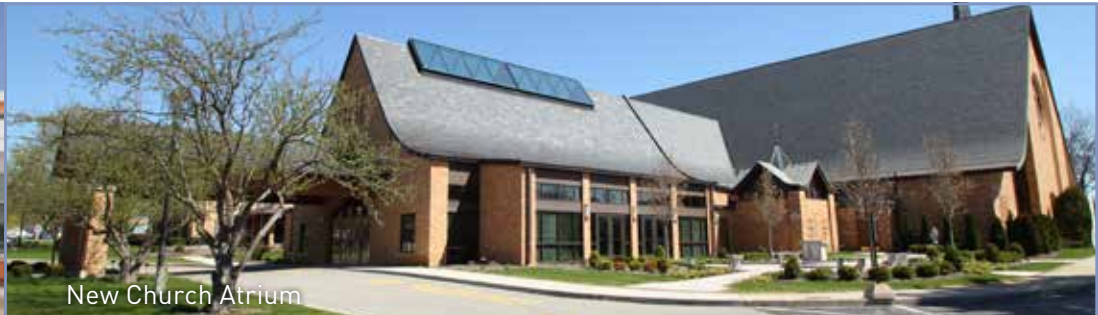
New Church Atrium